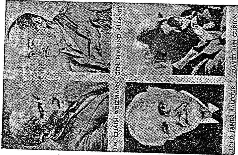
Etching of Chaim Weizmann courtesy of Harry S. Moskowitz Artist Phila. Penn. Lower two photos - Courtesy of Zionist Archives and Library of Palestine National Fund

Wherever the returning exiles are settling, they are, under Divine blessing, through scientific agriculture and fruit culture restoring the former fertility of the land. In 1927 the Pools of Solomon, dry for centuries, began to overflow and some 60,000,000 gallons of water were by measurements estimated to be in the pools. At that time the High Commissioner of Palestine was asked to declare a day of public thanksgiving for this seeming miracle. For many centuries the "early rains" had disappeared entirely. But, these have returned to gladden the land, with the result that some parts of Palestine yield two or three crops a year. By irrigation, drainage etc. hundreds of thousands of acres have been transformed from swampy, arid and